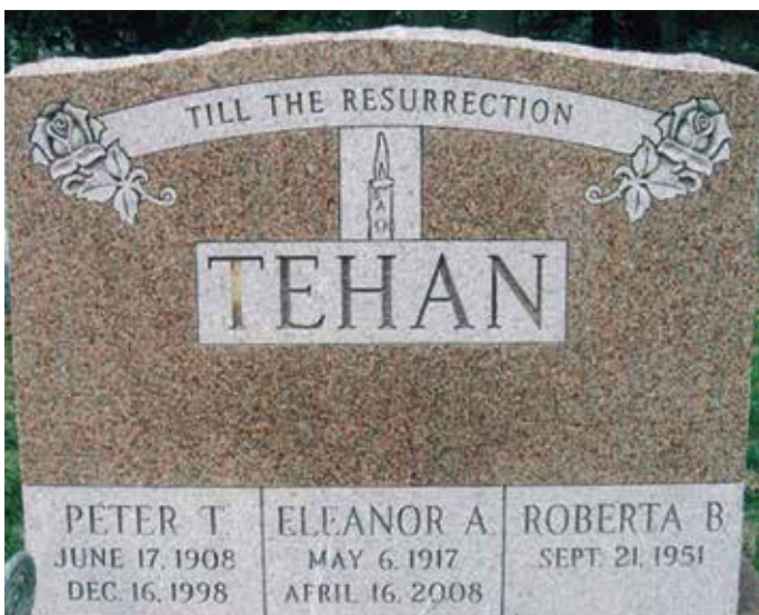
The Tehan family headstone with the Bethany Candle inscribed on it.